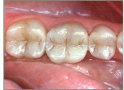
A natural look

Resin fillings are a great way to restore your back teeth. Because they bond directly to teeth, they provide the added strength that damaged teeth need to withstand frequent biting pressure. Also, we can match the color of the resin to your teeth to preserve your beautiful, natural-looking smile.