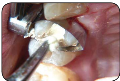
Placing the sedative filling