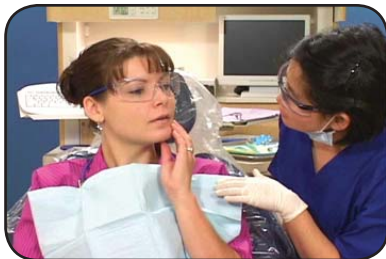
Numbing the area

Sedative fillings often contain oil of eugenol, which is a mild pain reliever, and zinc oxide, which has some disinfecting properties.