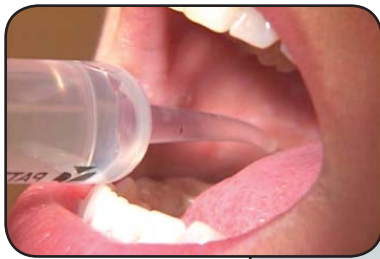
Rinsing with a medicated solution

After your tooth has been extracted, we'll give you complete instructions about caring for your mouth. Following them exactly will help you avoid dry socket. It's especially important to avoid certain behaviors that can cause the premature loss of a blood clot, particularly within the first 24 hours after an extraction.