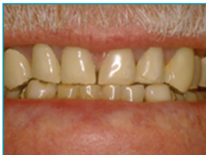
Worn teeth due to bruxism