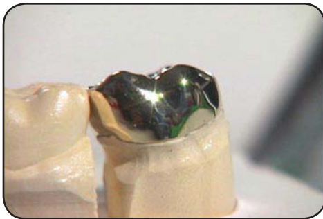
Gold crown placed on model

When a tooth needs a restoration, sometimes the best choice is a gold crown. A gold crown is precision-crafted in a dental laboratory, so it may take two or more appointments to restore your tooth with a gold crown.