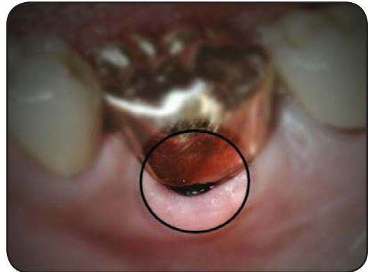
Decay at the margin of a crown